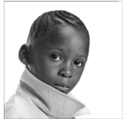
"You lookin at me?" by Fiona Senior of Southampton Camera Club

Each Federation sent their top two clubs plus the previous year's winners and runners up. The competition was fierce, but good humoured, and the standard exceptionally high., with photos from some of the top photographers in the Country. Our two clubs had a wonderful time and enjoyed a variety of superb prints.